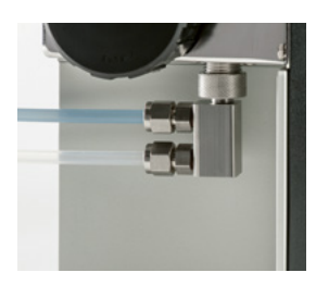
Online sampling device