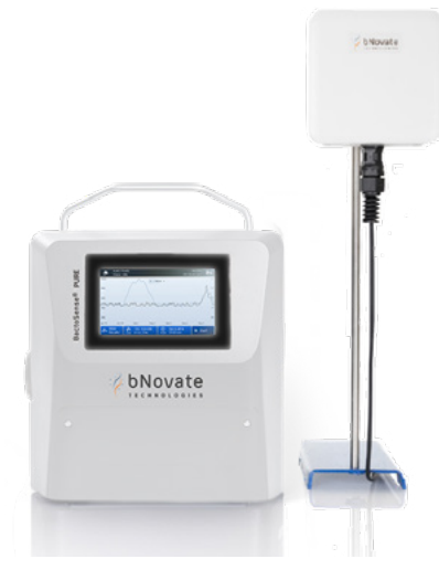
BactoLink mobile connectivity module