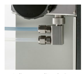
Online sampling device